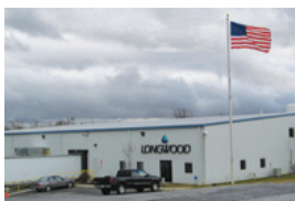
Plant Location 2 Wytheville, VA