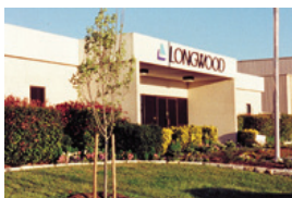
Plant Location Brenham, TX