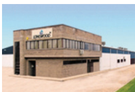
Plant Location Soria, Spain