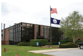
Plant Location 1 Wytheville, VA