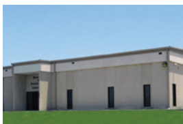
R&D Tech Center Brenham, TX