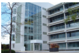
Global Headquarters Greensboro, NC

Longwood Elastomers European Sales Office Dachauer Strasse 342 80993 München, Germany +49 (89) 14 38 36 26 info@longwood-elastomers.com www.longwood-elastomers.com